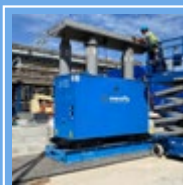
Handling of two electric generators with the Hydraulic Gantry Cranes in Sicily