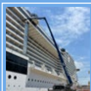
Werent equipment at work in the maintenance of cruise ships and superyachts

For Marraffa and Werent, change is not an obstacle, but an opportunity: the group is equipping itself to transport and rent in an increasingly sustainable way. The market calls for this, but above all our planet calls for it. (A.S.)