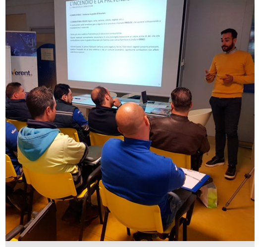
HEALTH AND SAFETY