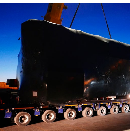
TRANSPORTING TWO BOILERS TO EGYPT