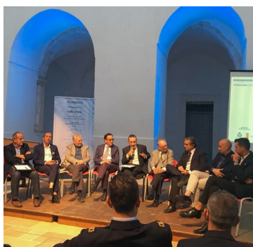
GUESTS OF THE "CORRIERE DELLA SERA" AT ORIZZONTE SUD

WE CAN DO WHAT WE WERE AFRAID WE WOULDN'T BE ABLE TO