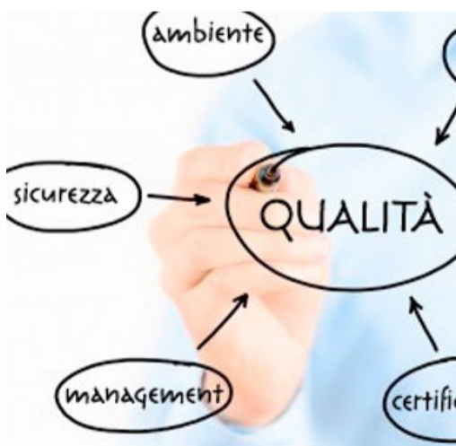
MARRAFFA-WERENT: CERTIFICATE OF QUALITY