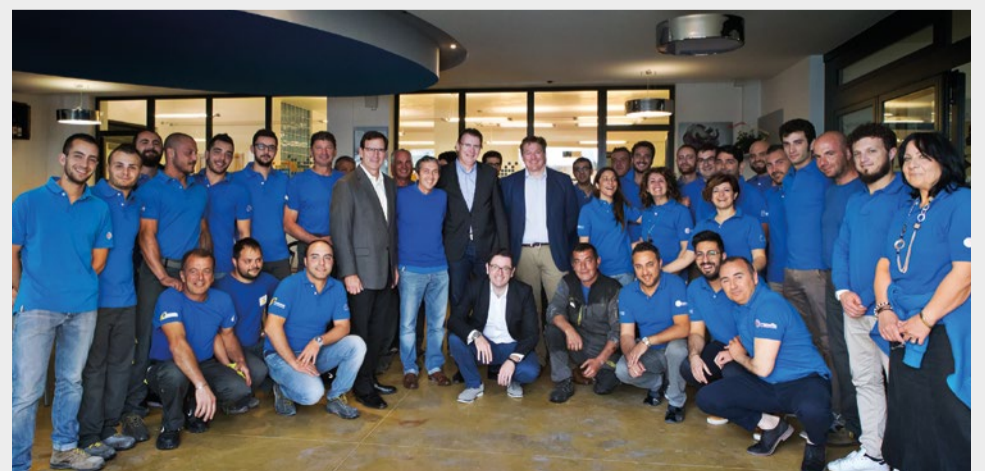
The Venpa Sud staff with the JLG executives